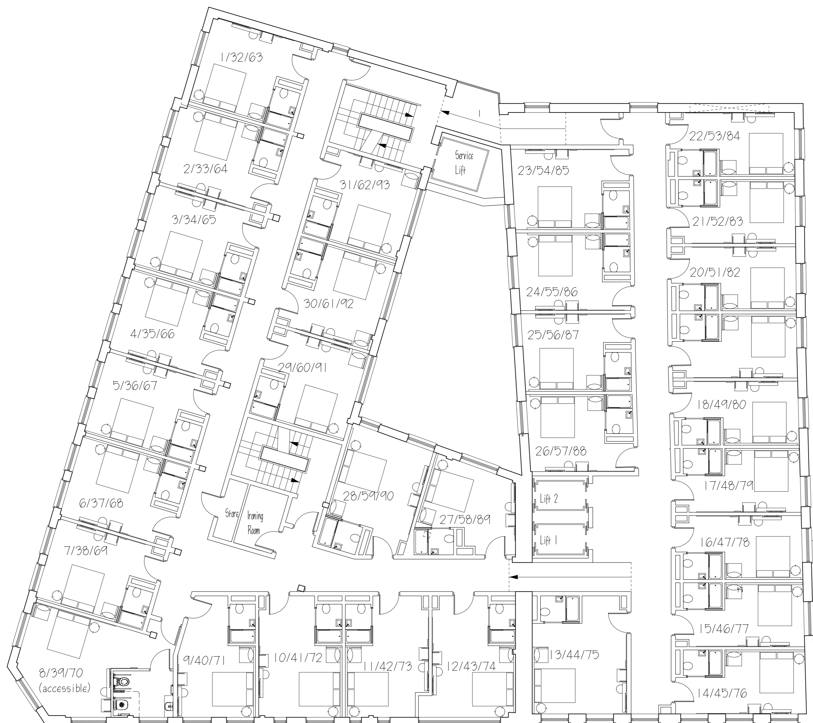
First, Second & Third Floor Plans 869 m 2 (9354 ft 2 )